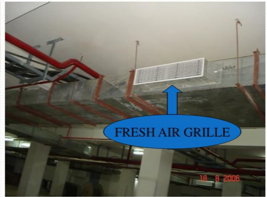
FRESH AIR GRILLE