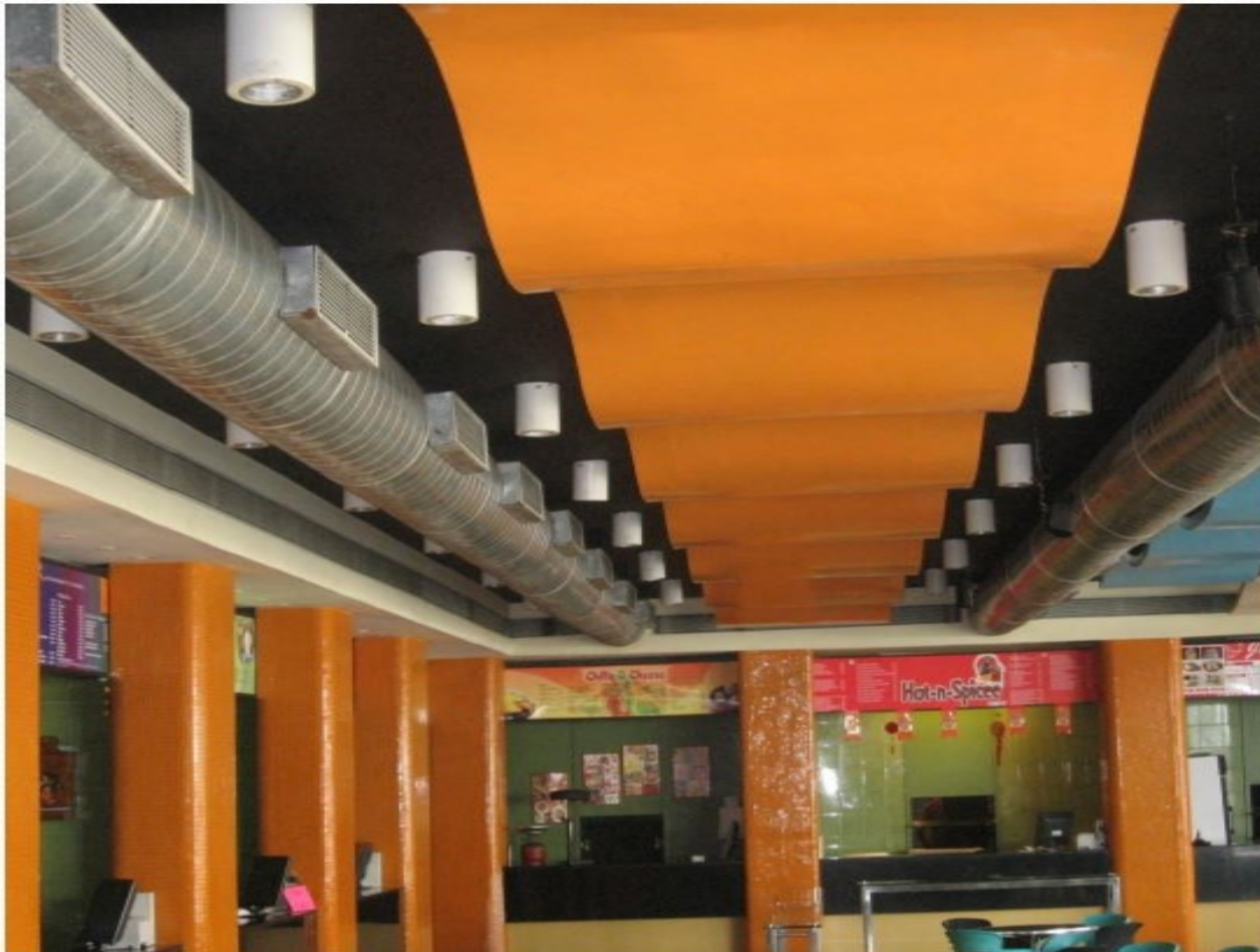
ROUND DUCTING AT HANGOUT, THE FOOD COURT