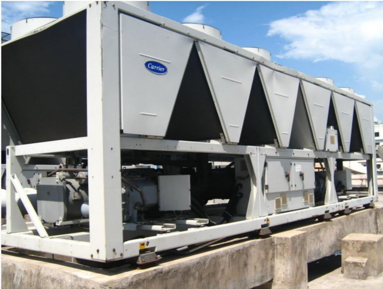
CHILLER INSTALLED AT TERRACE