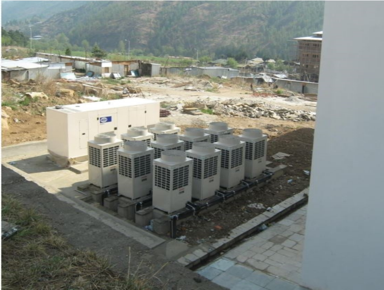
VRF OUTDOOR INSTALLATION