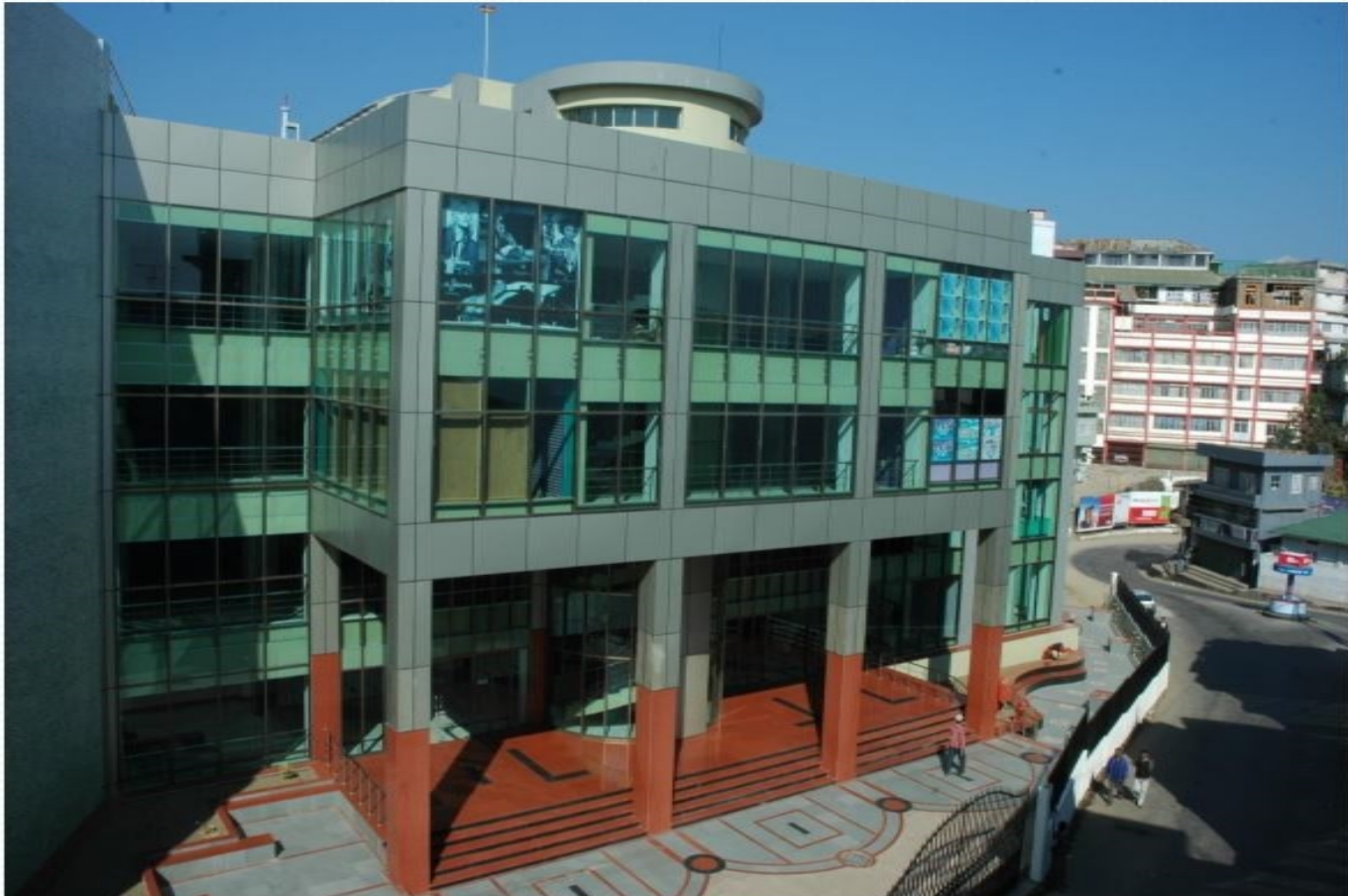
EASTERN SIDE VIEW