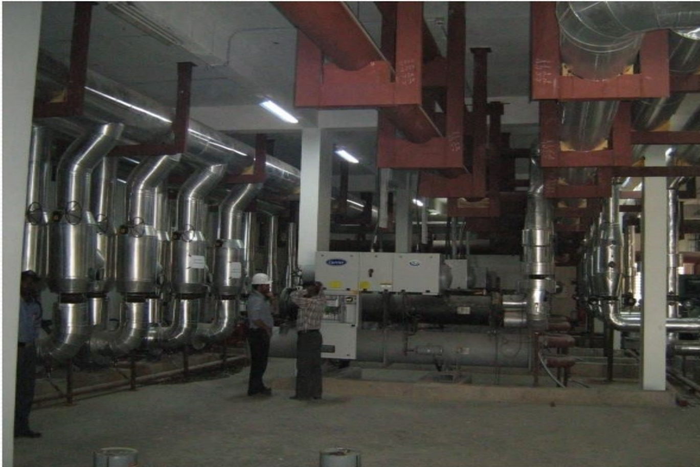
PIPING LAYOUT INSIDE PLANT ROOM