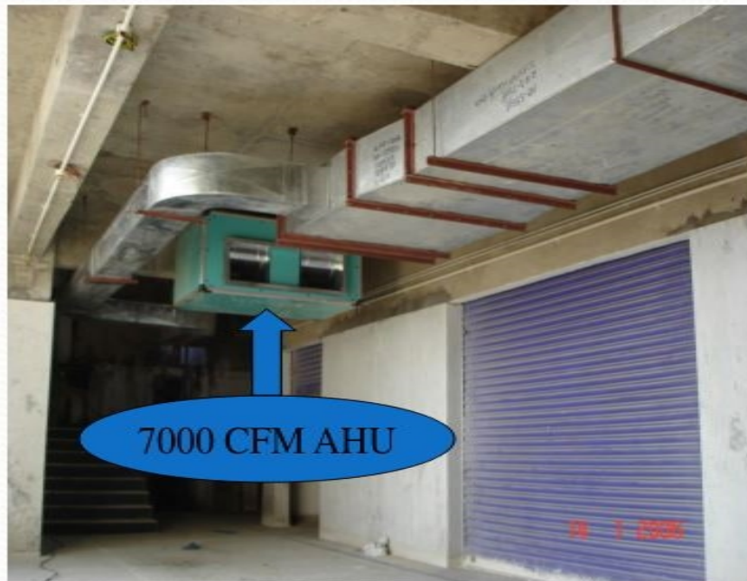
7000 CFM AHU