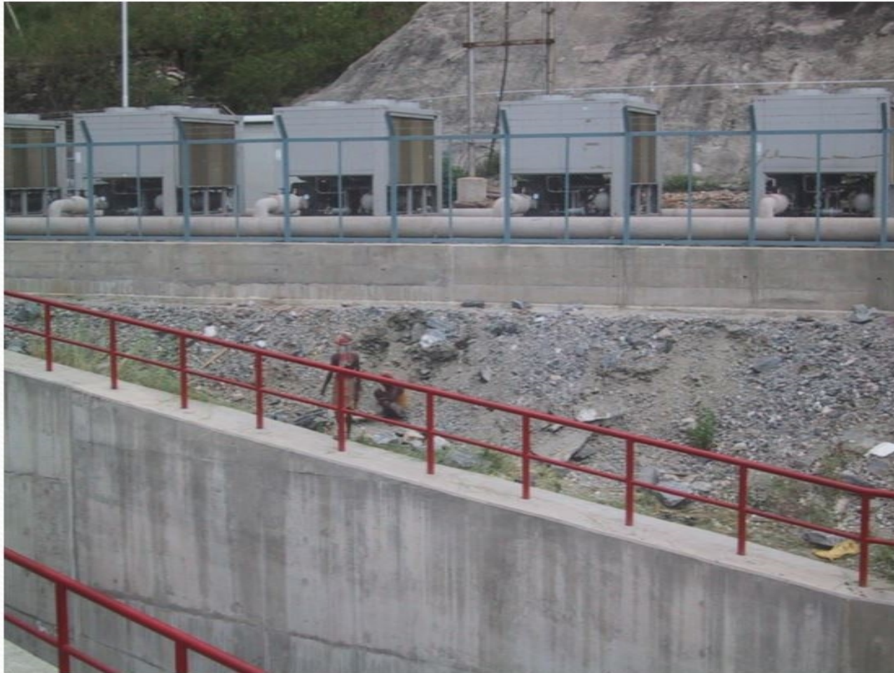
EQUIPMENT & CHW PIPING LAYOUT AT PLANT ROOM AREA