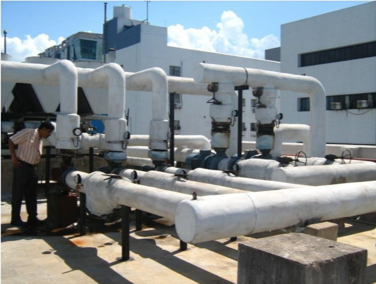
CHW PIPING LAYOUT AT PLANT ROOM AREA