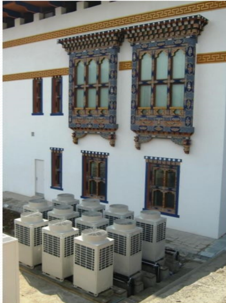
VRF OUTDOOR INSTALLATION